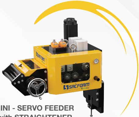
MINI - SERVO FEEDER with STRAIGHTENER