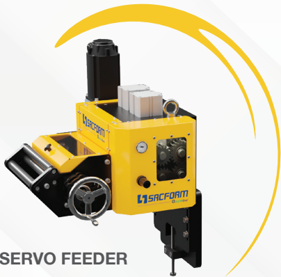
MINI - SERVO FEEDER