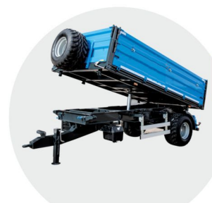
SINGLE AXLES - 1 WAY Tipping Agri-Trailer