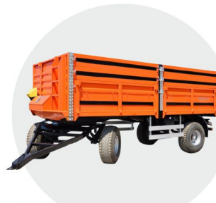
DOUBLE AXLES - 3 WAY Tipping Agri-Trailer