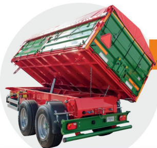
TANDEM - 3 WAY Tipping Agri-Trailer