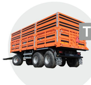
THREE AXLES - BACKWARD Tipping Agri-Trailer