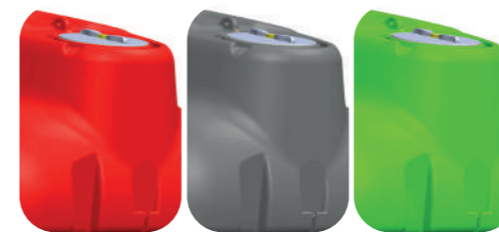
RED GREY GREEN