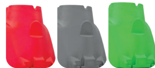
RED GREY GREEN