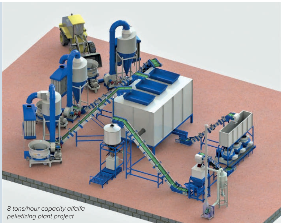
8 tons/hour capacity alfalfa pelletizing plant project