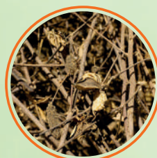
Corn, Cotton Stalks