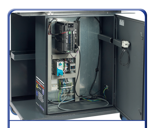
Sealed electrical box housing all NC controls and cabling