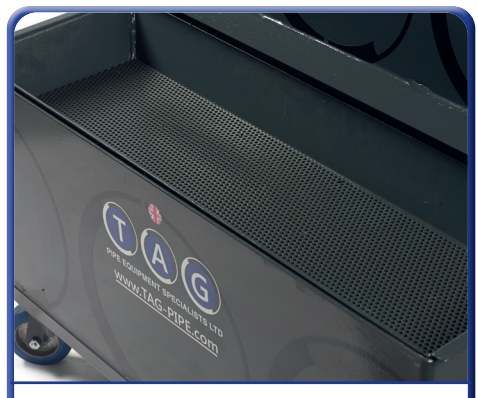
Built in coolant pump unit with drip tray as standard