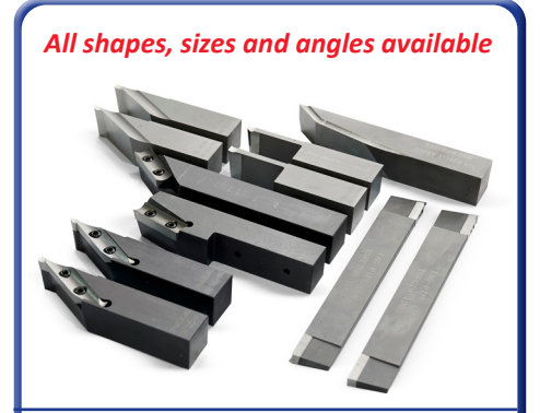
Wide range of cutting tools available for cutting all thickness's of pipe and bevelling at any required angle