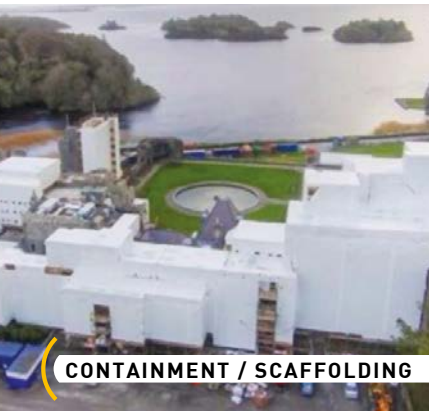
CONTAINMENT / SCAFFOLDING