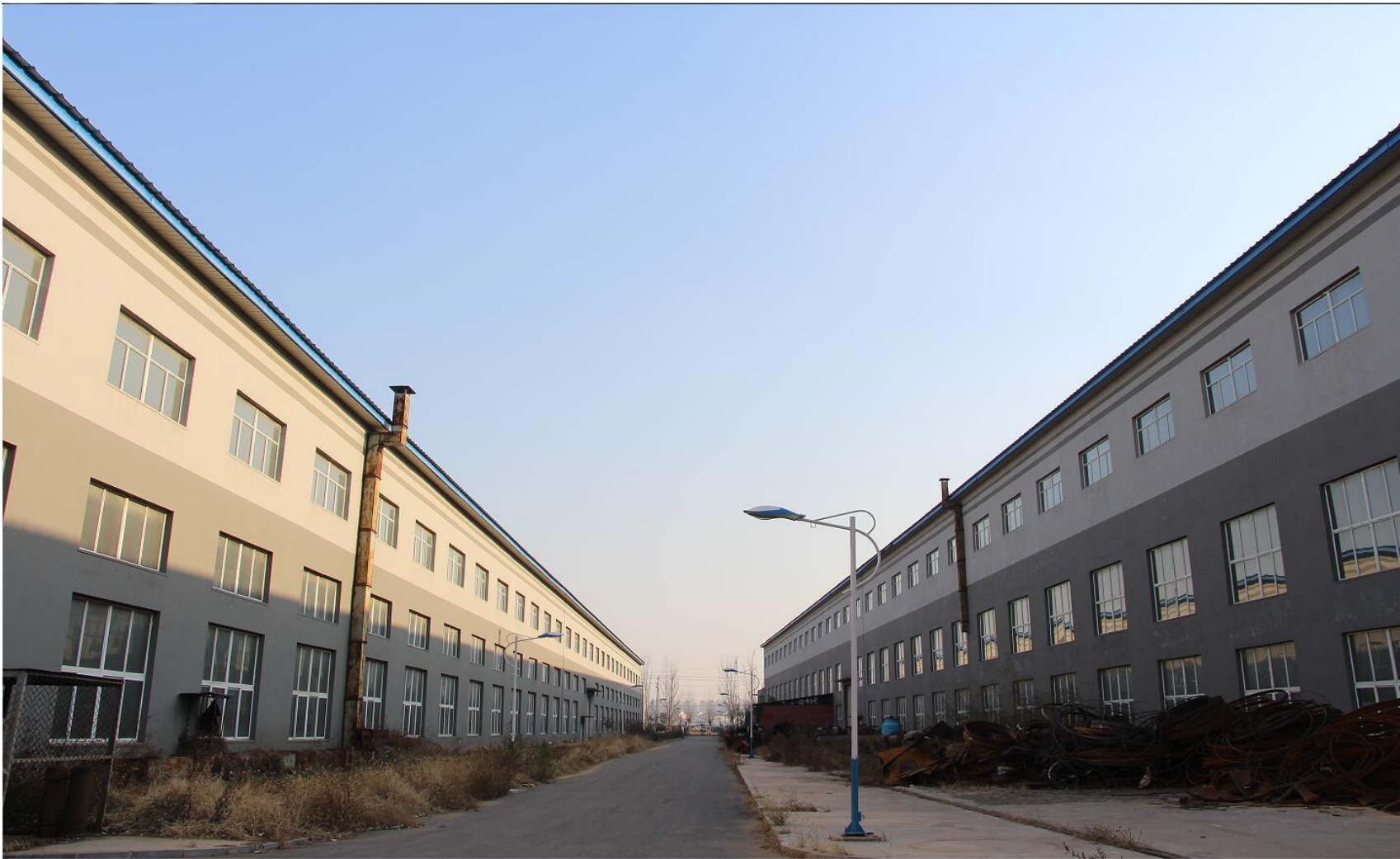
SINOPED FACTORY BUILDING