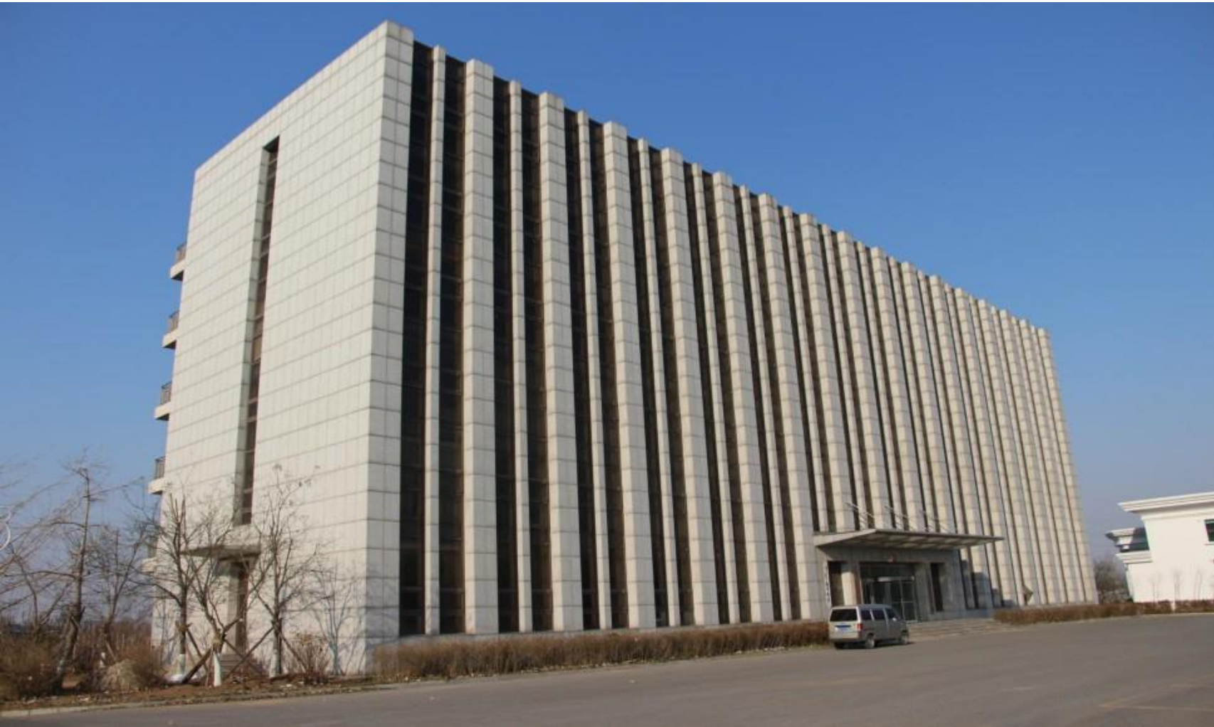
SINOPED OFFICE BUILDING