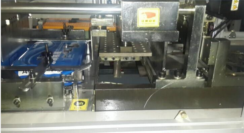
After packing complete a4product