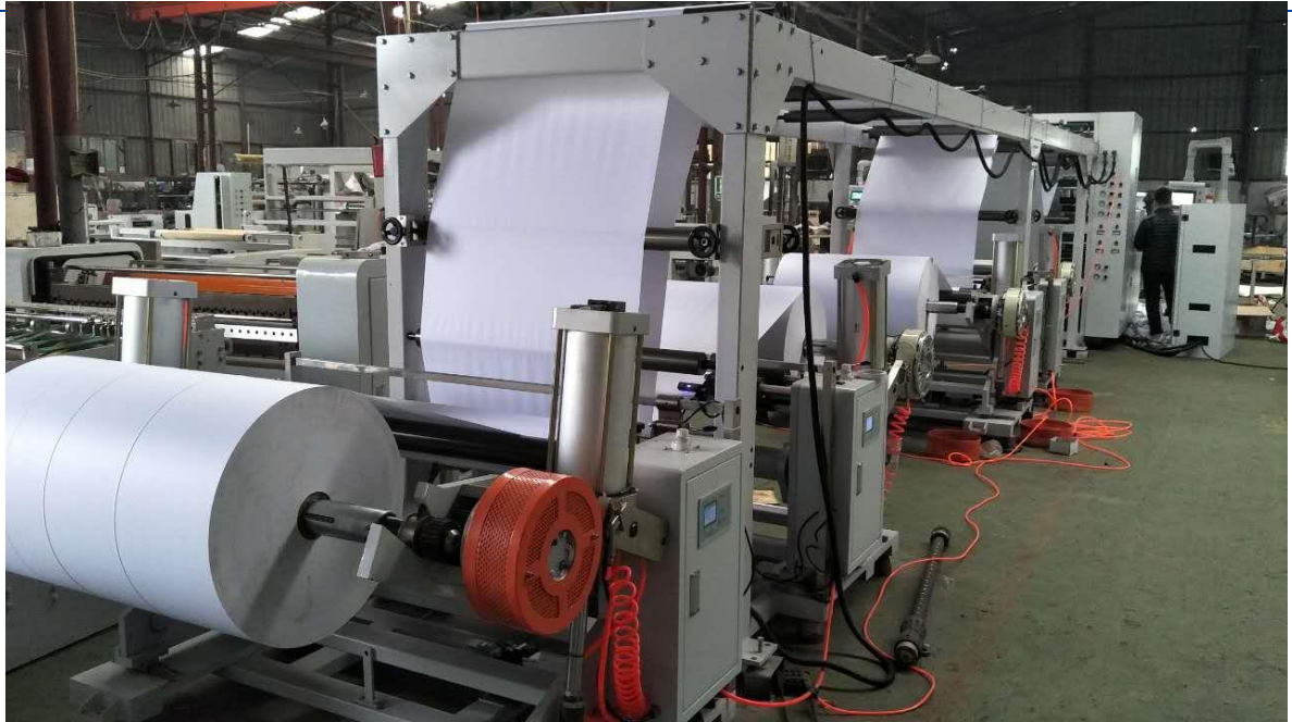
Slitting knives and cutting unit: (High cut precision \pm 0.2\text{mm} )