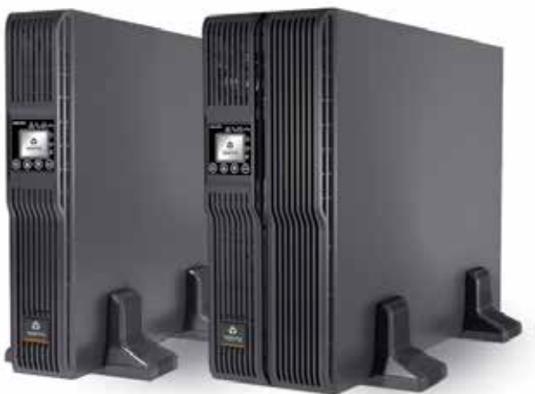
Liebert GXT4 700 - 3000 VA