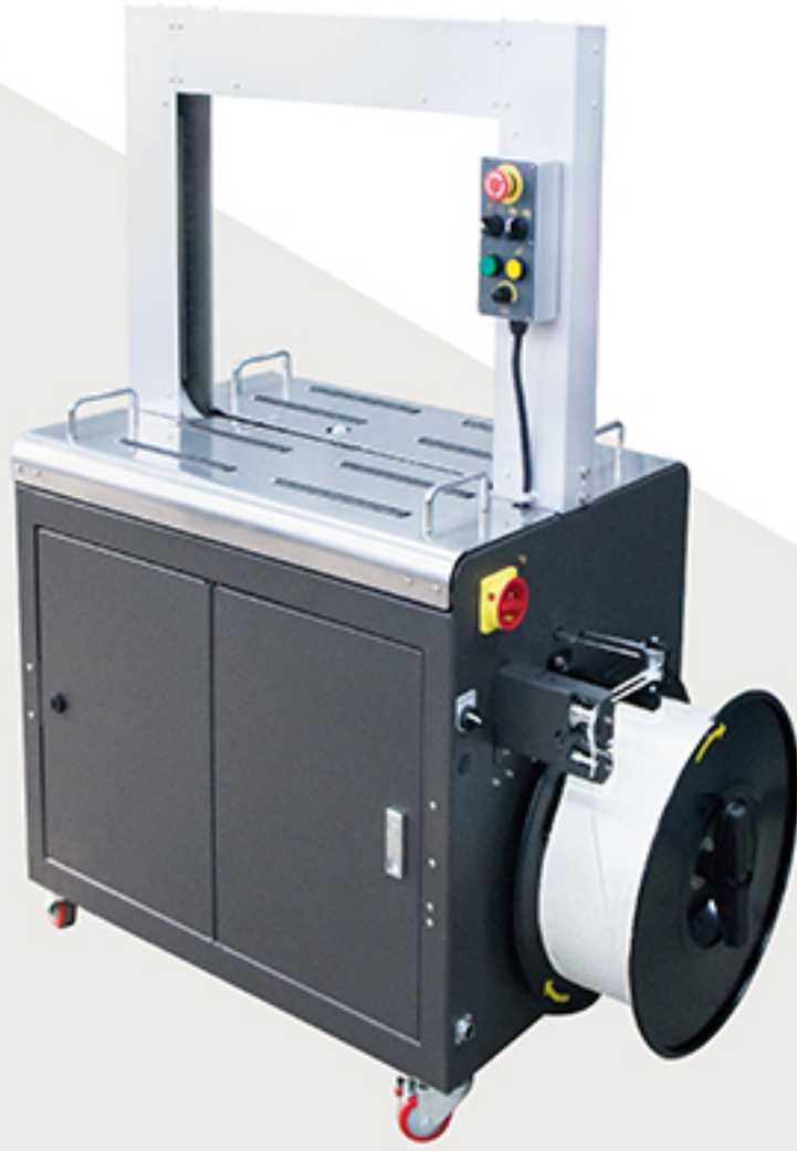
A-88 / A-85 Standard

To integrate compatible, flexible and affordable, A 8 series strapping system is designed with variety of strapping speed, full range of in & off-line, belt & roller driven. Diversity of options is available.