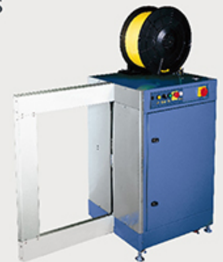
A-98 Y / A-93 Y Side Seal