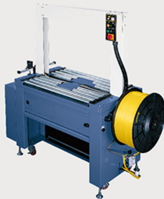
A-98 AR / A-93 AR In-Line Roller Driven