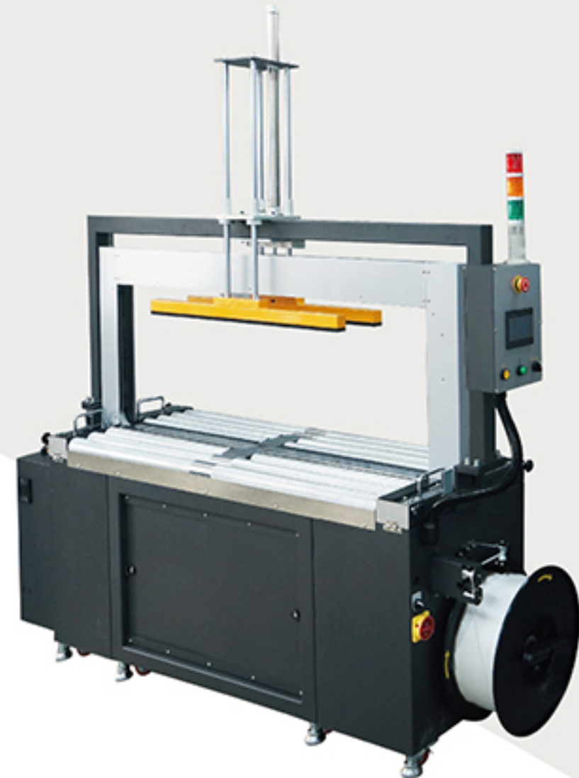
A-88ARP / A-85ARP In-Line Roller Driven/Top Press