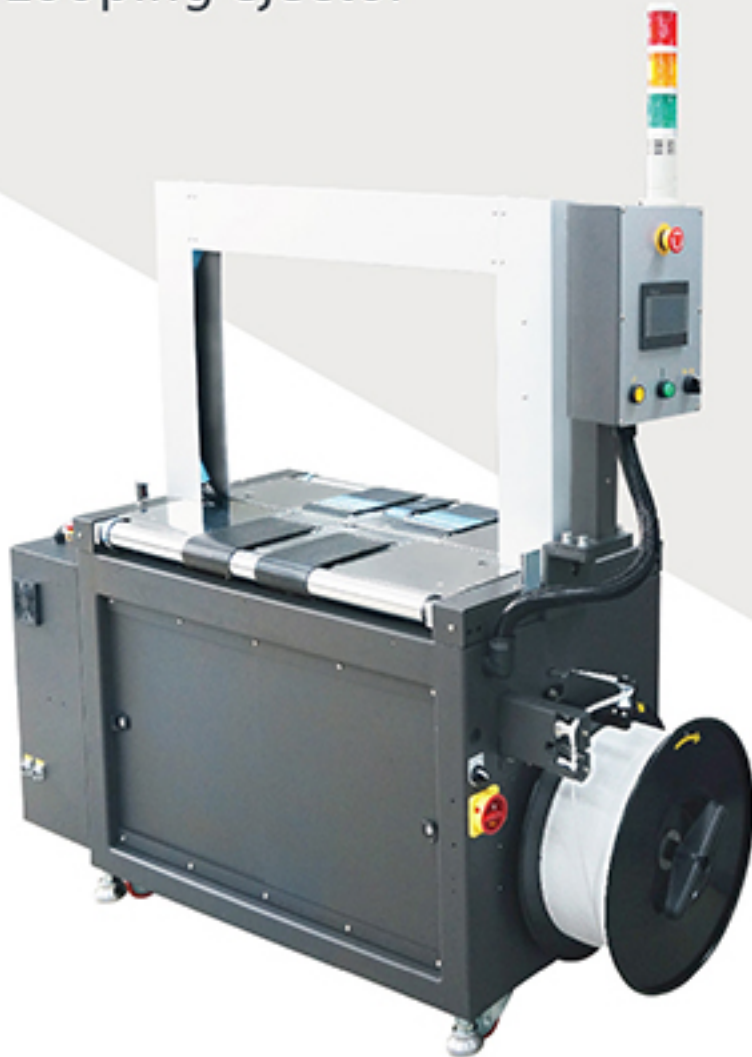
A-88AB / A-85 AB In-Line Belt Driven