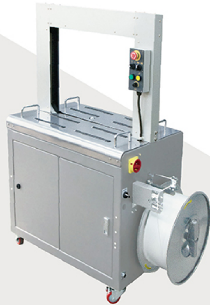
A-88M / A-85M Stainless Steel Housing