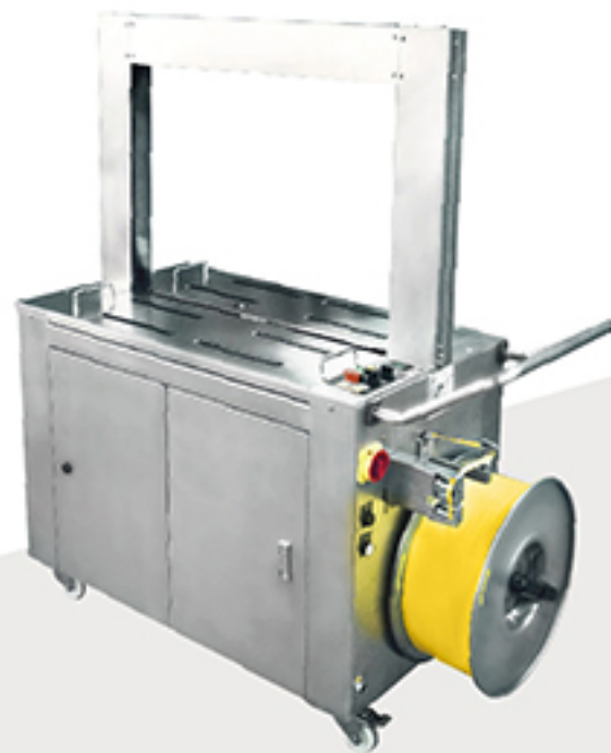
A-98M / A-93M Stainless Steel Housing