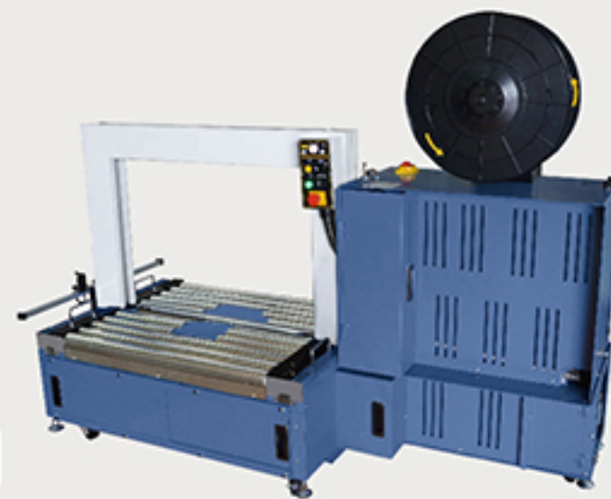
A-98LAR / A-93LAR In-Line Roller Driven Low Table