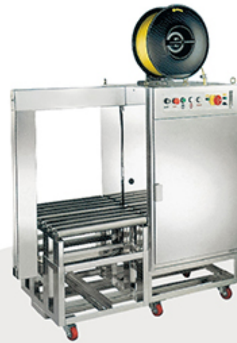
A-98YMT / A-93-YMT Stainless steel housing with roller table