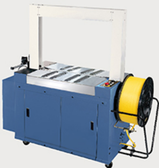
A-98AB / A-93 AB In-Line Belt Driven