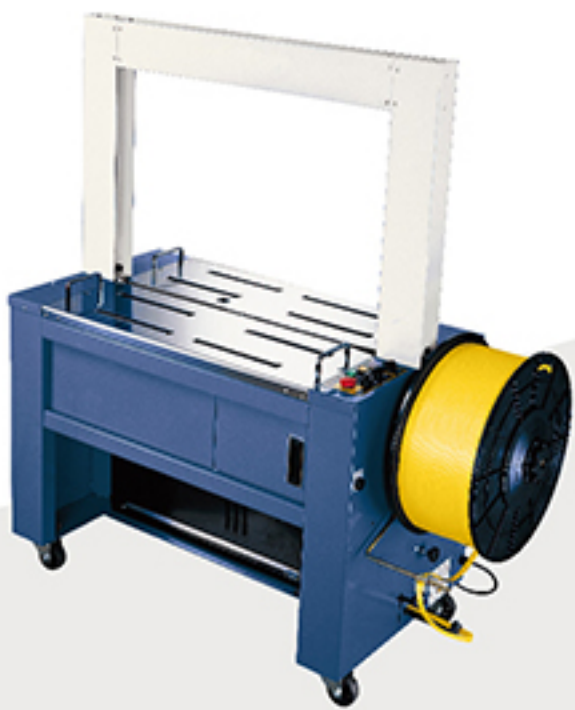
A-98 / A-93 Standard

Provide the flexibility, reliability and simplify maintenance for general applications. By adopting servo driven, speed is faster and efficiency higher.