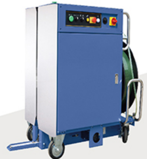
S-72YO Mobile pallet strapping