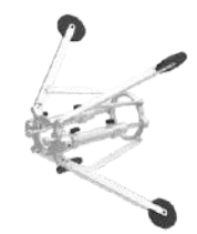
BRUSH CENTERING DEVICE. For ducts from 500 mm | 19.7 inch to 1000 mm | 39.3 inch. AC33031030