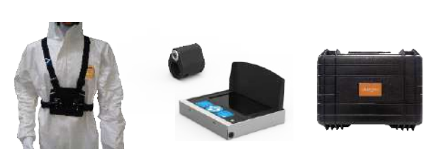
VISUALIZATION PACK. Visualization system, camera harness, camera and carrying case. AC33031031