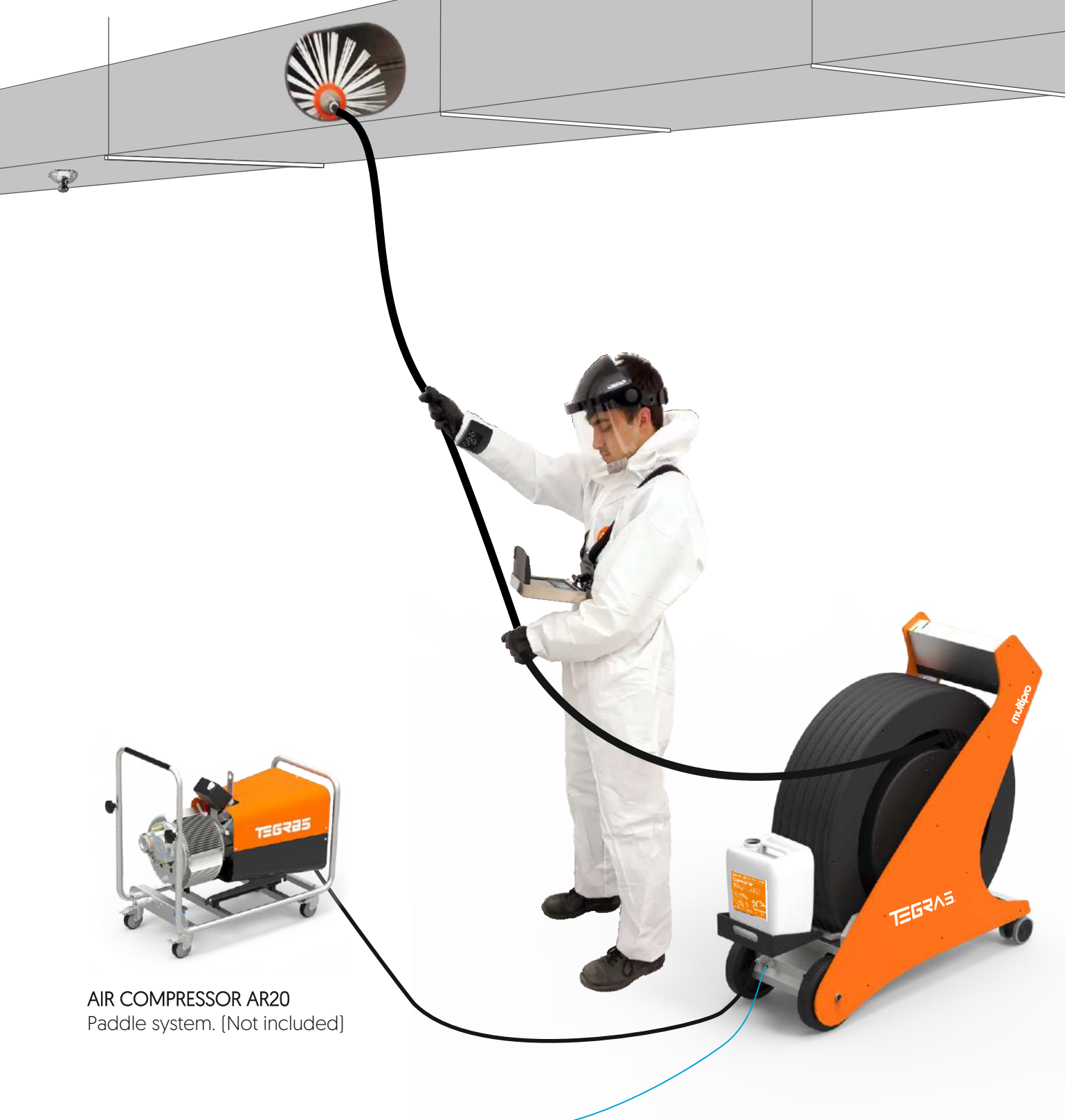
AIR COMPRESSOR AR20 Paddle system. [Not included]