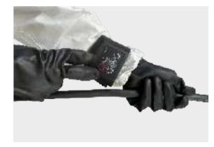
WRIST REMOTE CONTROL Operate by one person AC3303604